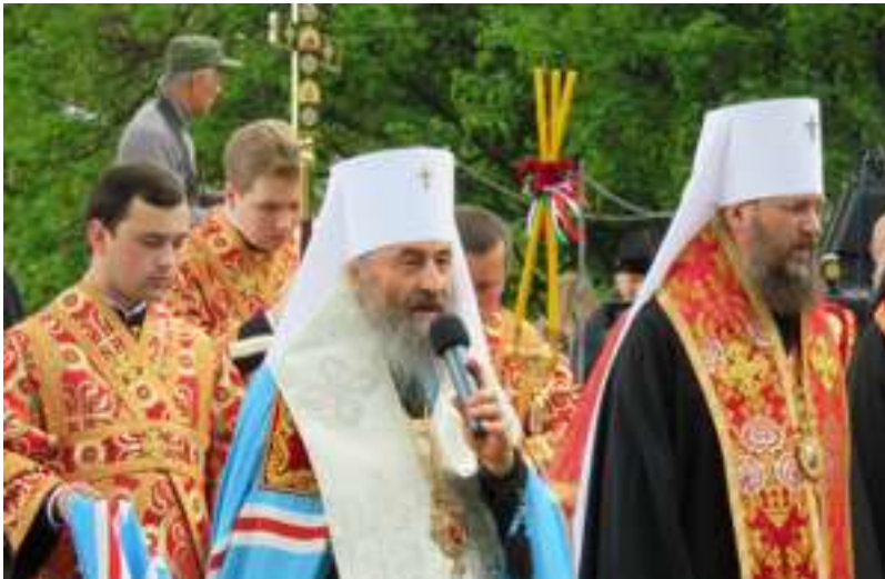
Metropolitan Onufry (Berezovskyy), Kyiv, 8 May 2016

Finally, the concept of a religious "expert examination" is also vague and legally questionable. Across the post-Soviet region, including in Belarus , occupied Crimea , and Central Asian states such as Kazakhstan , "expert analyses" are often used to justify freedom of religion or belief and other human rights violations, including jailing prisoners of conscience.