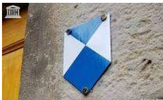
UNESCO Shield Emblem protecting religious and cultural property

HRWF (18.05.2023) - As of 17 May 2023, UNESCO has verified damage to 256 sites since 24 February 2022 – 110 religious sites, 22 museums, 92 buildings of historical and/or artistic interest, 19 monuments, 12 libraries, 1 Archive.