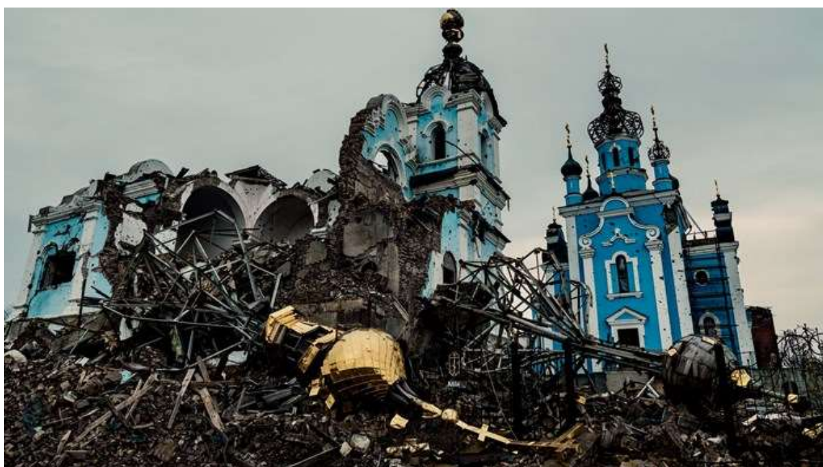
A fallen dome lies near the Church of the Holy Mother of God ('Joy of All Who Sorrow'), destroyed by a Russian aerial bomb on January 18, 2023 in Bohorodychne, Ukraine.

By Willy Fautré, director of Human Rights Without Frontiers