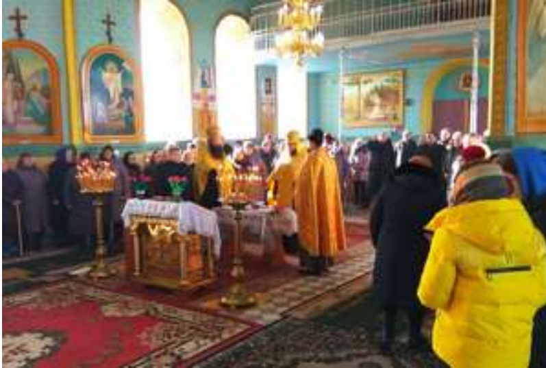
Liturgy in Orthodox Church of Ukraine parish, Stara Pryluka, 1 January 2023