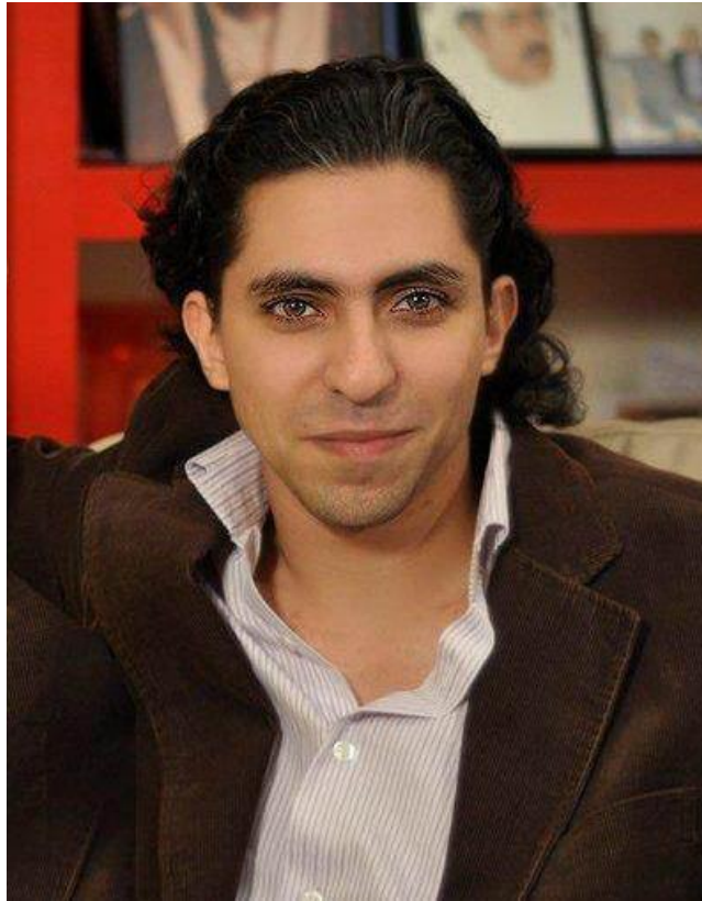
Raif Badawi: a prisoner of conscience

Raif Badawi is the laureate of this year's Sakharov Prize for Freedom of Thought, following an October 29 decision by EP President Martin Schulz and the political group leaders. Badawi is a blogger from Saudi Arabia currently serving a 10-year prison sentence for insulting Islam on his website promoting social, political and religious debate.