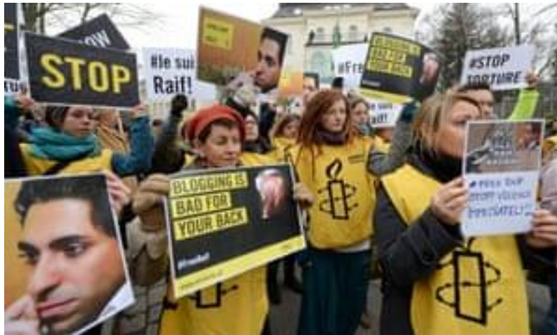
People protest outside the Saudi embassy in Vienna in January 2015, against the flogging of Raif Badawi.

Form of corporal punishment will be replaced by jail terms, fines or a mixture of both