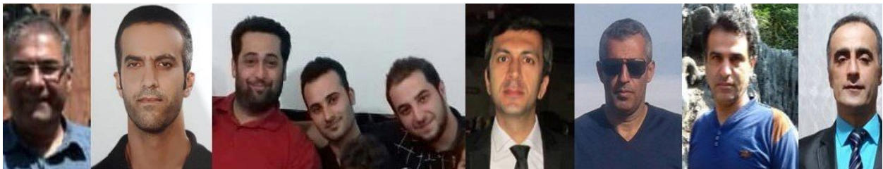
Iranian Christians request prayer for nine men of the "Church of Iran" denomination who have each received a five-year prison sentence due to their Christian faith and activity.