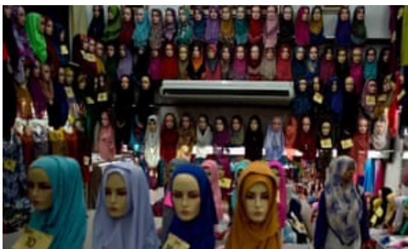
A Malaysian woman walks past mannequins displaying hijabs at a market in Kuala Lumpur.

Hannah Ellis-Petersen South-east Asia correspondent