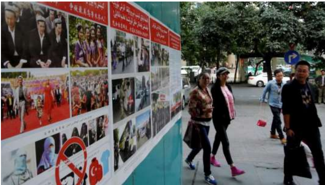
Pedestrians walk past propaganda posters in Urumqi, Xinjiang.

The Dui Hua Foundation's Human Rights Journal (27.02.2018) - http://bit.ly/2q4qXRB -