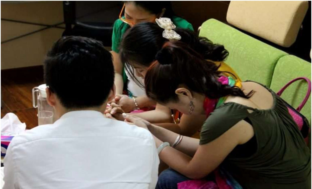
Christians pray together in Beijing.

World Watch Monitor (23.01.2018) - http://bit.ly/2rKmHiW - A Chinese court in the southwestern province of Yunnan sent six Protestant Christians to prison last week for their membership of an "evil cult".