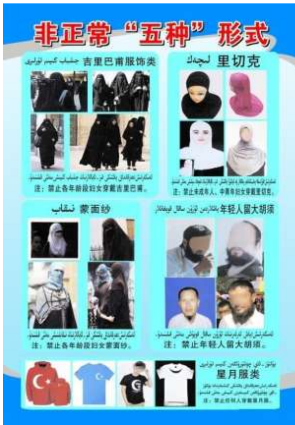
The "Five Abnormalities" in Karamay, Xinjiang August 2014.

The restrictions on Islamic clothing in Xinjiang first emerged in a number of localities in province's southern region. However, after the 2009 Urumqi attacks, similar regulations were implemented in northern Xinjiang. Restrictions in the north remained relatively lax until 2013, when the Xinjiang government issued a provisional-wide directive known as Document No.11. In a question and answer format, the document serves as a set of guidelines for local authorities and as a warning to the public on how "illegal religions and extremism" will be handled; there are three mentions of the ban on the jilbab in the text. The document does not specify what the punishment for wearing a jilbab is. It merely calls on officials to "resolutely handle" violators.