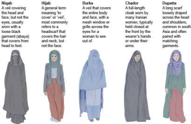
The five main categories of Islamic clothing in the Islamic world.

Violators of the aforementioned bans can face criminal prosecution under a number of offenses. One can be prosecuted for “forcing others to wear terrorism, extremism clothes or symbols,” a new offense that carries a maximum sentence of three years’ imprisonment. It was added to the Criminal Law in November 2015 and can be used in cases where violence or coercion is involved. Dui Hua is unable to find online judgments to understand how often this offense is being used by authorities. Unofficial news media has reported on cases of Uyghur women sentenced for promoting the wearing of headscarves, but the exact charges remain unknown.