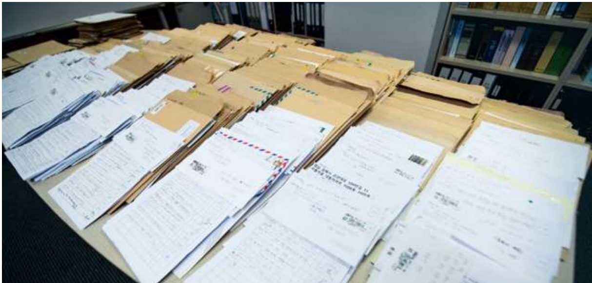
The national office of Jehovah's Witnesses organized the petitions

After the highly publicized meeting, Jehovah's Witnesses in South Korea organized a campaign to collect signatures on petitions addressed to the president. The government's policy of punishing conscientious objectors with imprisonment has deeply affected generations of Witnesses. Since President Moon has directed his administration to respond to petitions from the country's citizens, the petitions request the president's help to find a solution to the problem that conscientious objectors have faced for some 70 years.