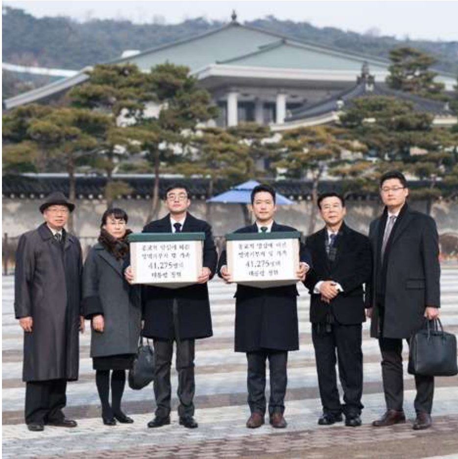
Petitions submitted to the Office of the President, January 15, 2018

On January 15, 2018, 6 representatives of the 41,275 Witnesses who signed the petitions presented them to the Office of the President. The petitions expressed gratitude for the president’s interest in the issue, highlighted the negative effects of the 70 years of punishing conscientious objectors with imprisonment, and emphasized the benefits to the nation of resolving the issue. On January 16, 2018, the Office of the President forwarded the petitions to the Ministry of National Defense for its consideration.